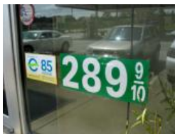
(ENLARGE)

Prices for E85 at the Safa Express BP were $2.89 a gallon Monday.