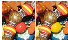
What's altered in the two photos? See how you score when you play the Find 5 challenge!

QUAN Hot Stock Pick Explores Robotics Area that Could Mean Huge Gains - Invest Now! QuantumInnovators